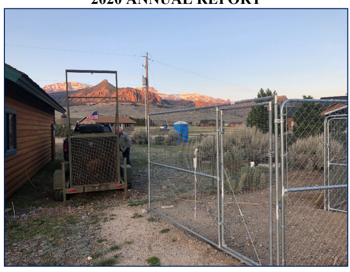
Photo of a grizzly bear captured at a residence in the Cody Region, 2020.