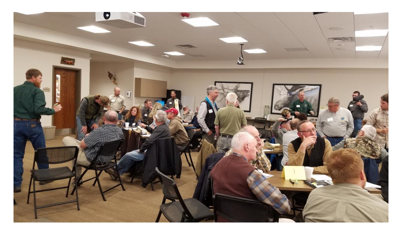
Figure 2: CWD Public Meeting in Laramie