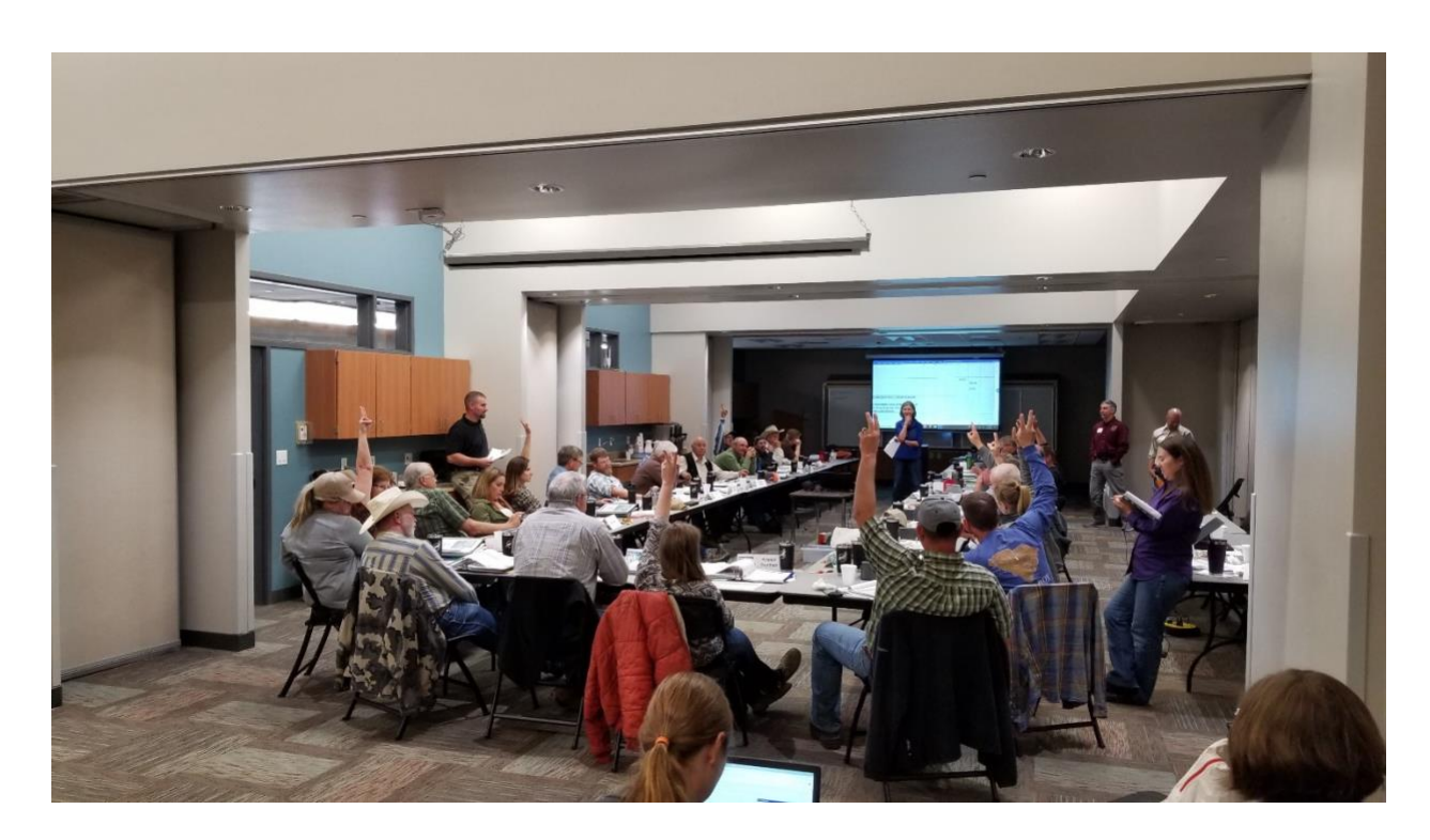
Figure 3: Working Group testing for consensus September 2019 in Lander